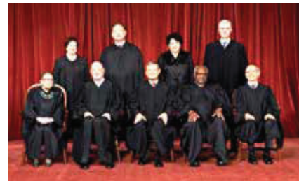
U.S. Supreme Court Justices