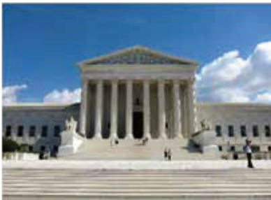
U.S. Supreme Court Building